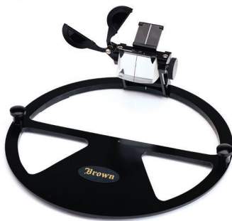
Azimuth Circle (Prism and Vane Types)