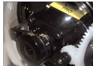
160° Vertical Tilt, Manual Focus Hi-Res Camera

Rear facing high resolution black & white 430 lines of resolution / 0.1 lux