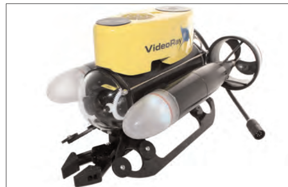
152m (500 ft) Depth Rated Pro 3 XE GTO With Optional Manipulator Arm

Two year limited warranty covering manufacturing and component defects. Upon or after warranty expiration this warranty can be renewed annually.