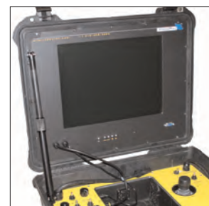
Simple Controls - Integrated 15" LCD