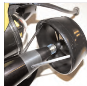
Powerful, Efficient GTO Thrusters