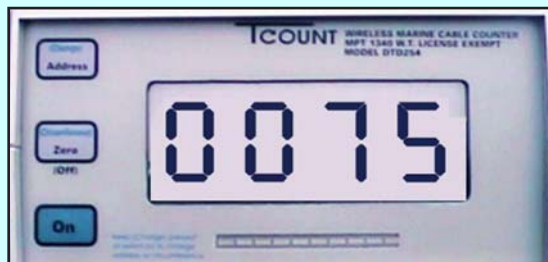
DTD254 Desktop display can be used as main display or as a repeater

* Assumes the snatch block wheel to be stationary ** Assumes a count of 6000 revolutions every day!