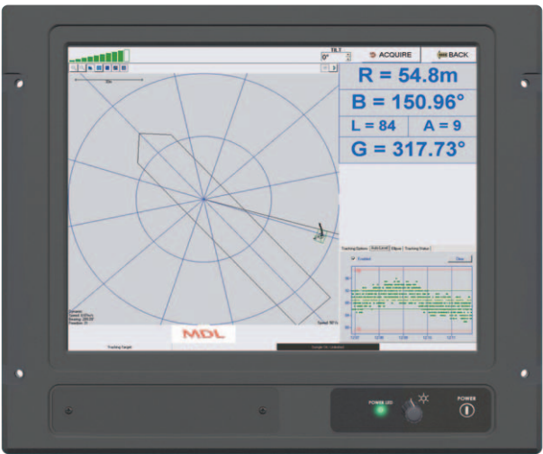
Touchscreen panel PC with new software